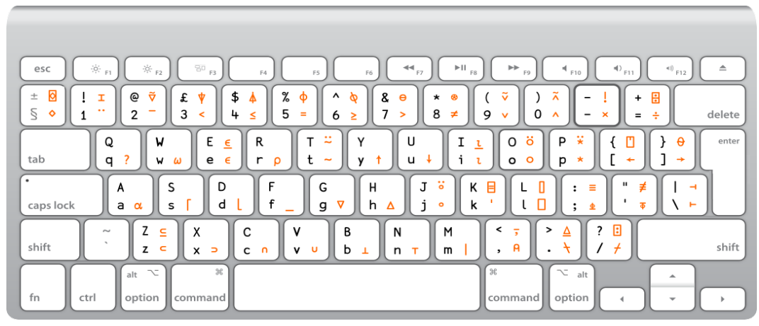
Figure A-1: The default Session keyboard key mappings (UK keyboard)

The keyboard key mappings shown in Figure A-1 are enabled whenever a Dyalog Session is started.